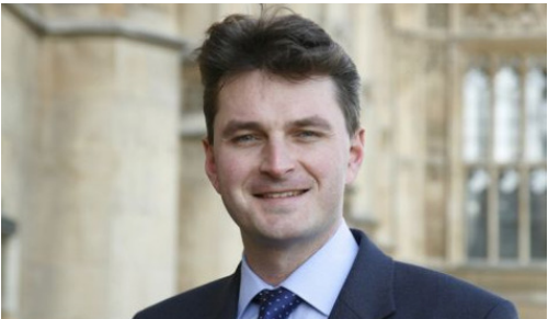
Daniel Kawczynski, MP, Chairman of the Saudi Arabia All-Party Parliamentary Group, in the United Kingdom.

For a complete list of the current Honorary Committee members, please visit our website.