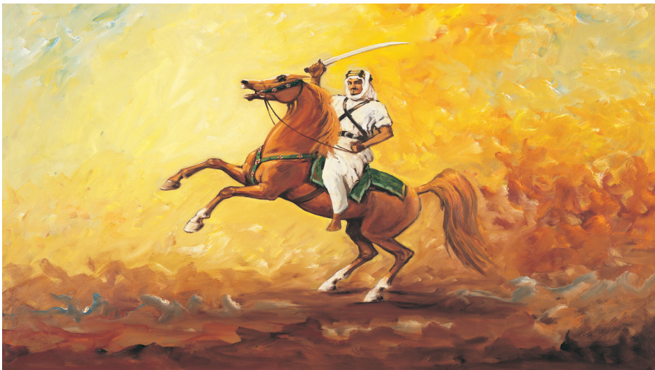
King Faisal of Saudi Arabia