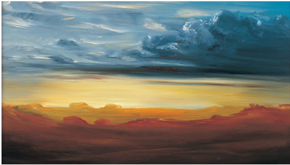
Mountain Sunset 2

For more information on the Royal Limited Lithograph Collection please visit our comprehensive website at www.khalidalfaisal.org or contact the Painting & Patronage London office on +44 (0) 20 7591 0619 or by email on enquiries@paintingandpatronage.com