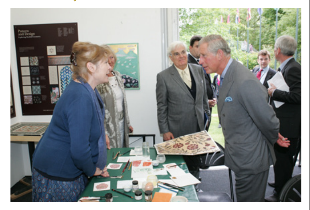
London - 19 September 2010 . HRH The Prince of Wales visited the Painting & Patronage stand and met students and teachers at the Start Garden Party held in the gardens of Clarence House, Marlborough House and Lancaster House.